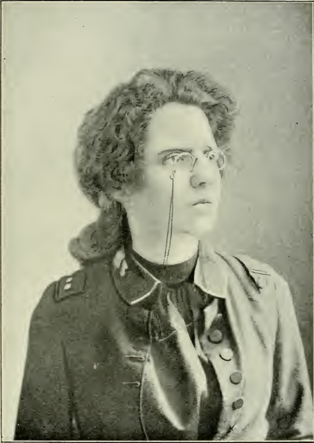
EMMA BOOTH-TUCKER (Died 1903)